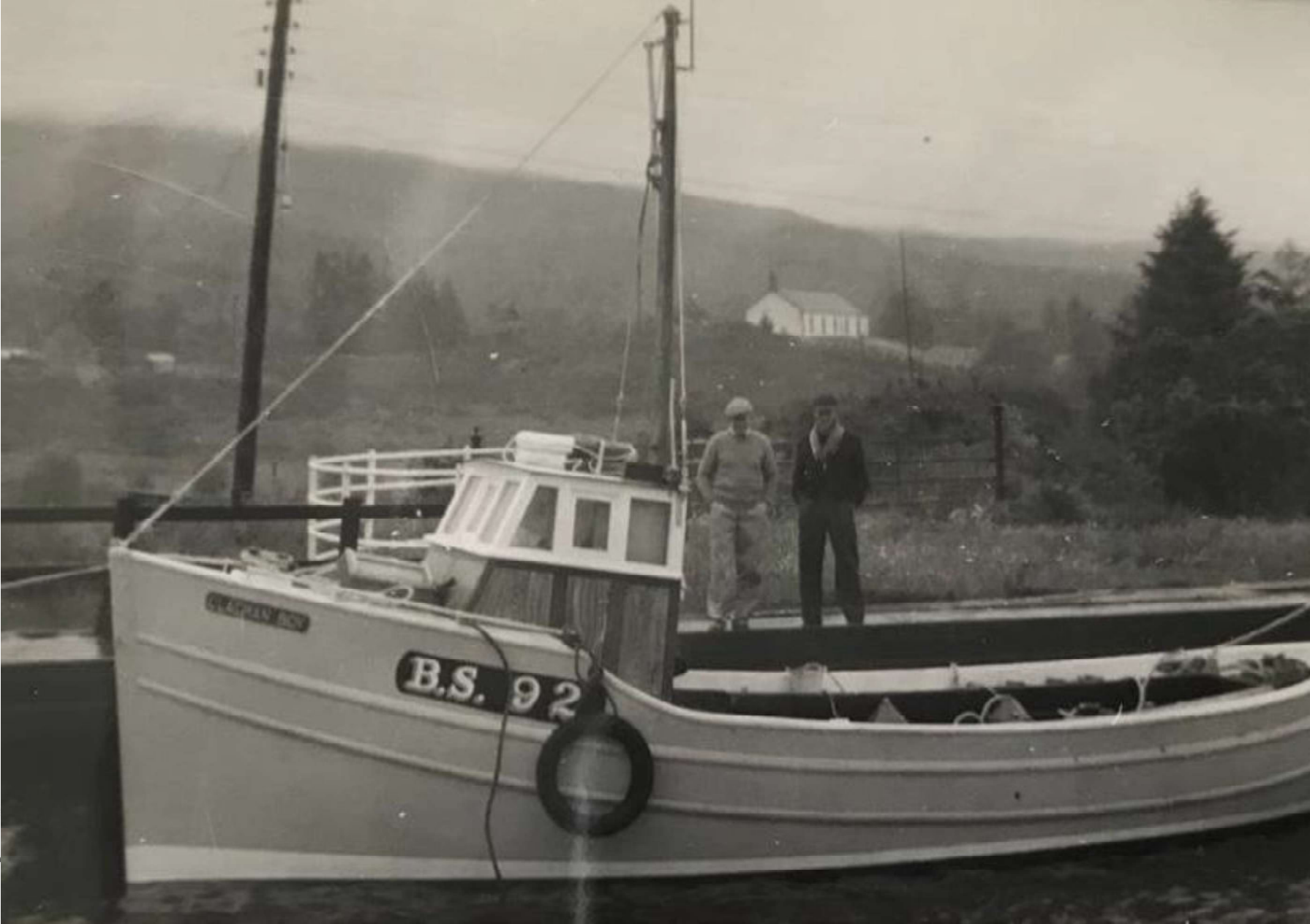
The Clachan Boy coming through the Caledonian Canal