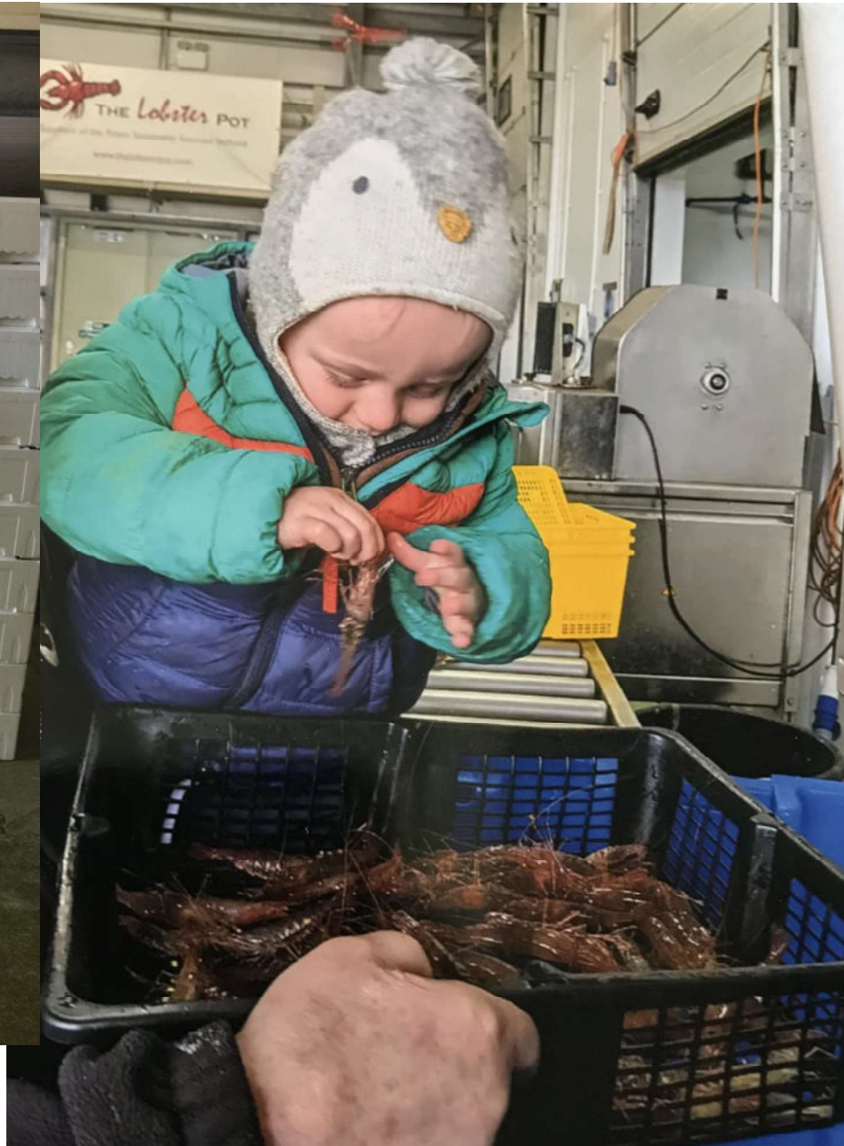
The Fourth Generation – 3 of my 5 grandsons